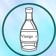
120ml white wine vinegar