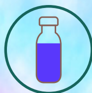
Food colouring 3 - 6 colours