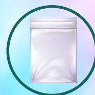
Resealable plastic bags